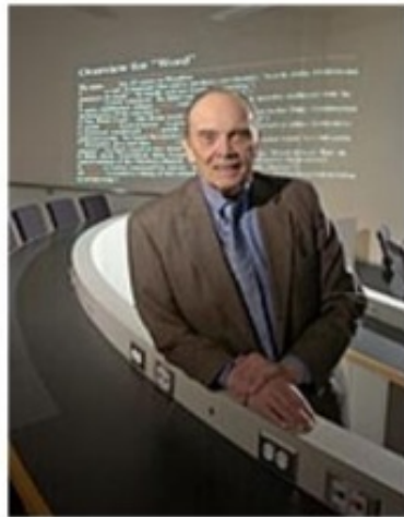
George A. Miller (1920-2012)

Para esta sesión, vamos a hacer una tarea sencilla para entender mejor cómo funcionan las relaciones léxicas que se dan entre lexemas (o palabras ). Usaremos entonces WordNet , un lexicón electrónico del que ya hemos visto algunas cosas.